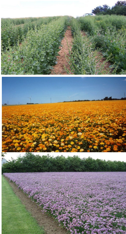
Vegetable seed in Denmark